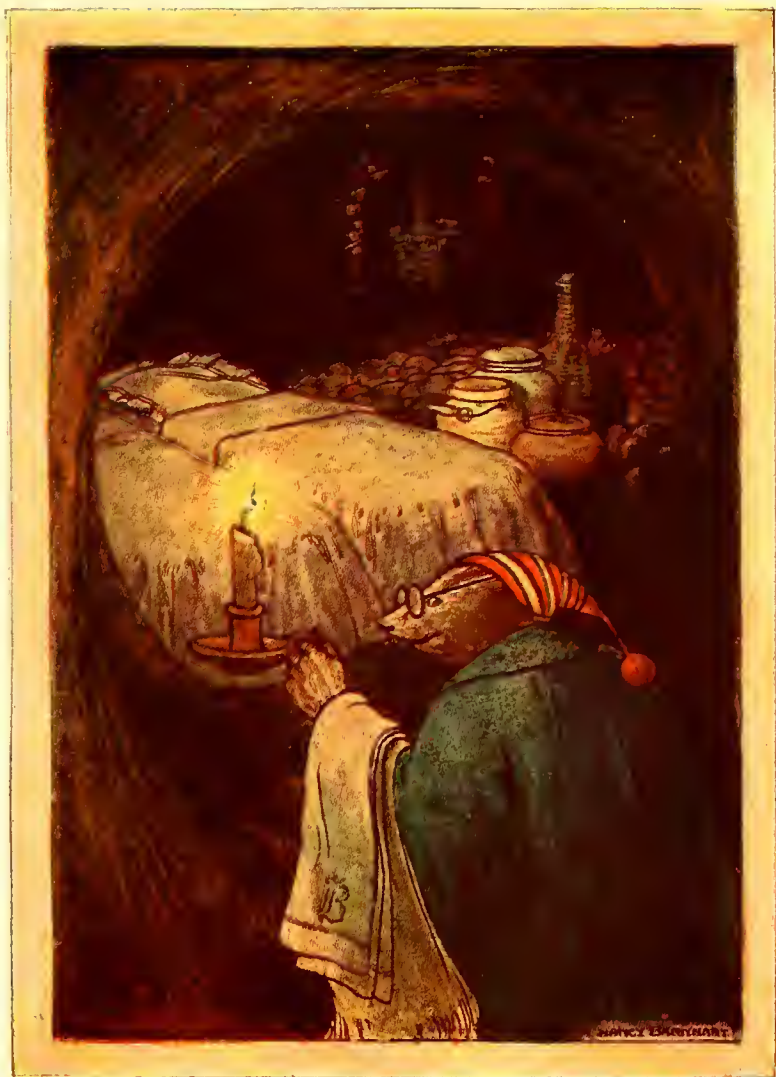
THE TWO LITTLE WHITE BEDS LOOKED SOFT AND INVITING